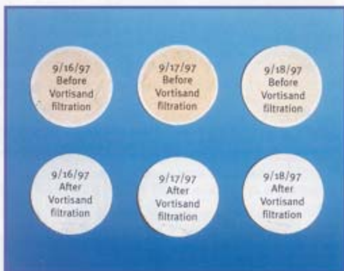
FIGURE 2 ▶ SAMPLES OF 1.5-MICRON PAPER FILTER TESTS THAT SHOW CLEANER WATER AFTER VORTISAND FILTRATION (0.45-MICRON FILTRATION)

Regularly, a suspended solids test using a 1.5-micron paper filter (Figure 2) and a particle size analysis (Figure 1) were done to demonstrate and to evaluate the need for fine filtration and the efficiency of the Vortisand filter (0.45-micron) installed at Rolland inc.